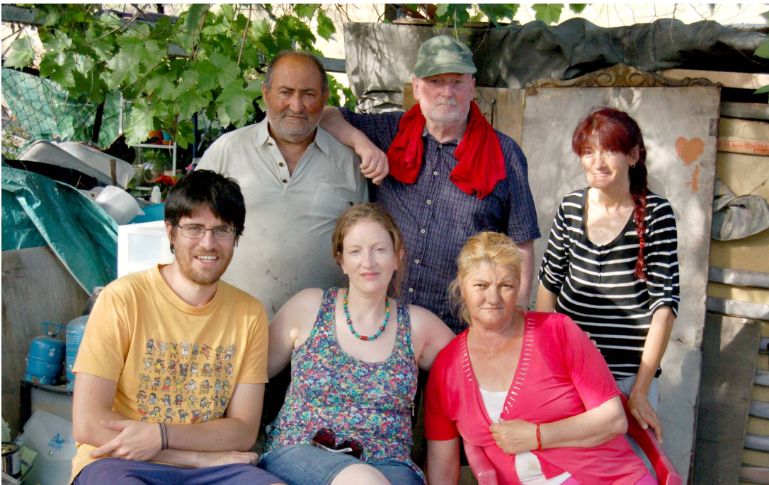
June 2016 An Irish delegation attends a “People’s University” in Madrid and visits participants at home in Las Barranquillas, a slum area on Madrid’s doorstep