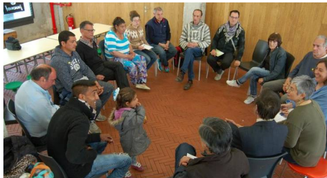
People's University of April, 9th 2016, Work and training, for all?

Photolanguage , is a methodology which develops communication through pictures. Photolanguage is a particularly suitable tool for people who have the most difficulty expressing themselves and being understood by others.