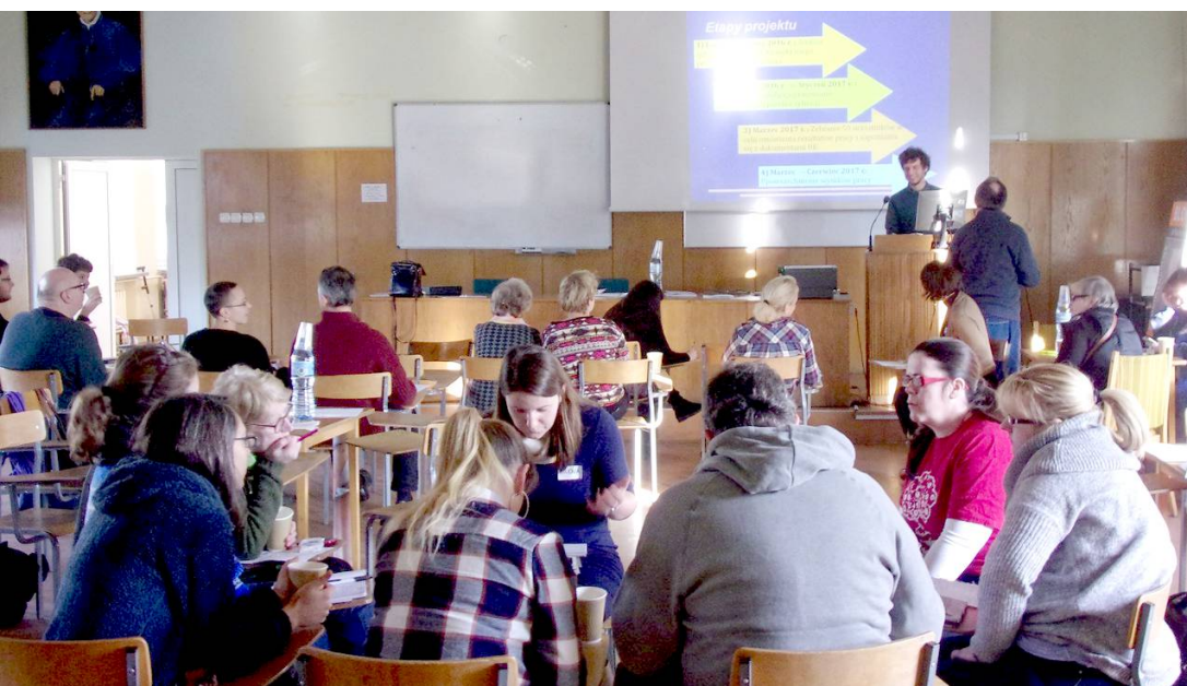
Polish – Irish “Merging of Knowledge” working session” at Warsaw University - November 2016