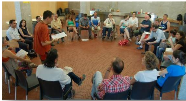
People's University, June 11th 2016 Revenue and decent life Building social securities for all

Some of us, for example, have difficulties attending a job interview or keeping a job. A specific example is the issue of transport to the workplace.