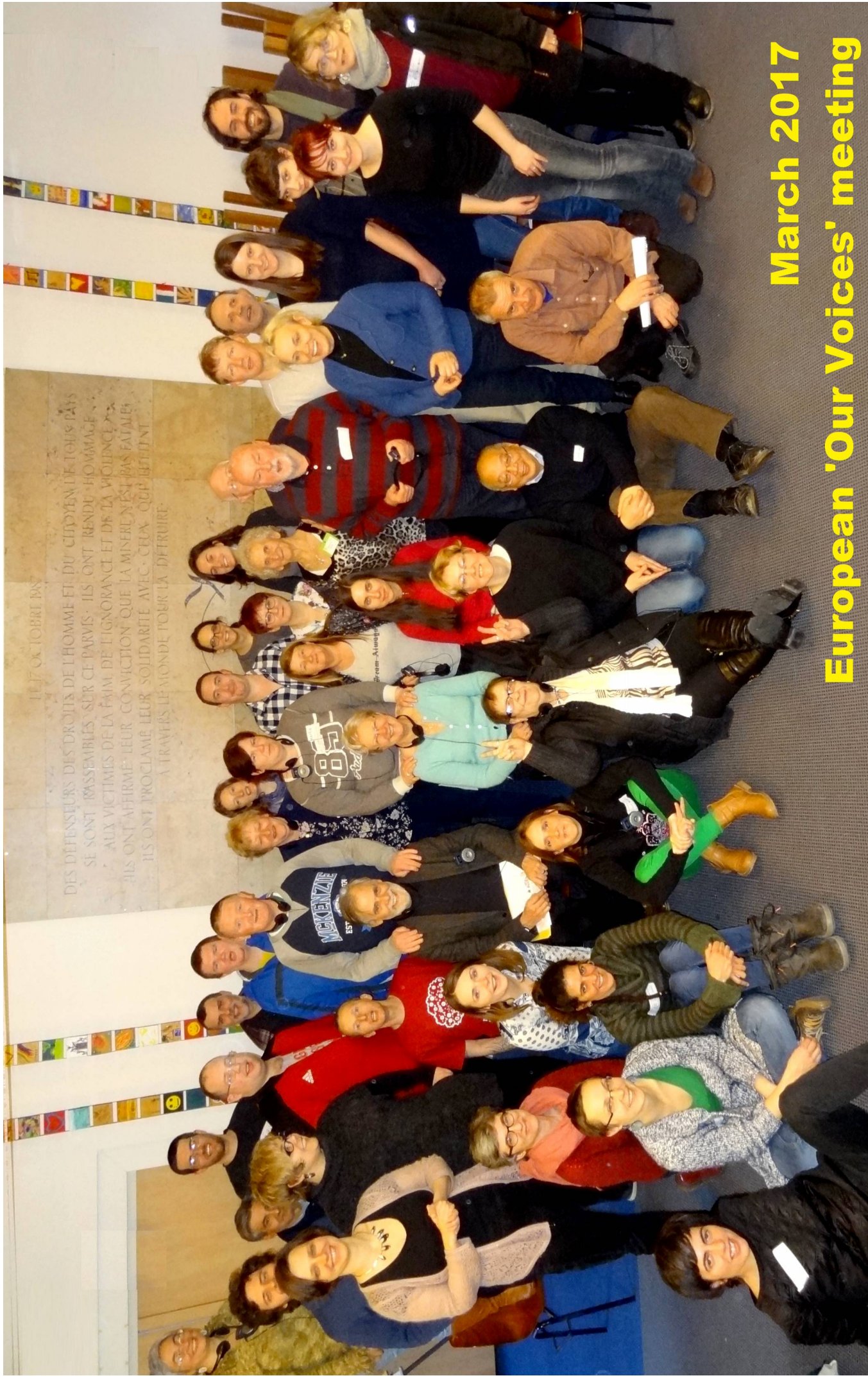
March 2017 European 'Our Voices' meeting