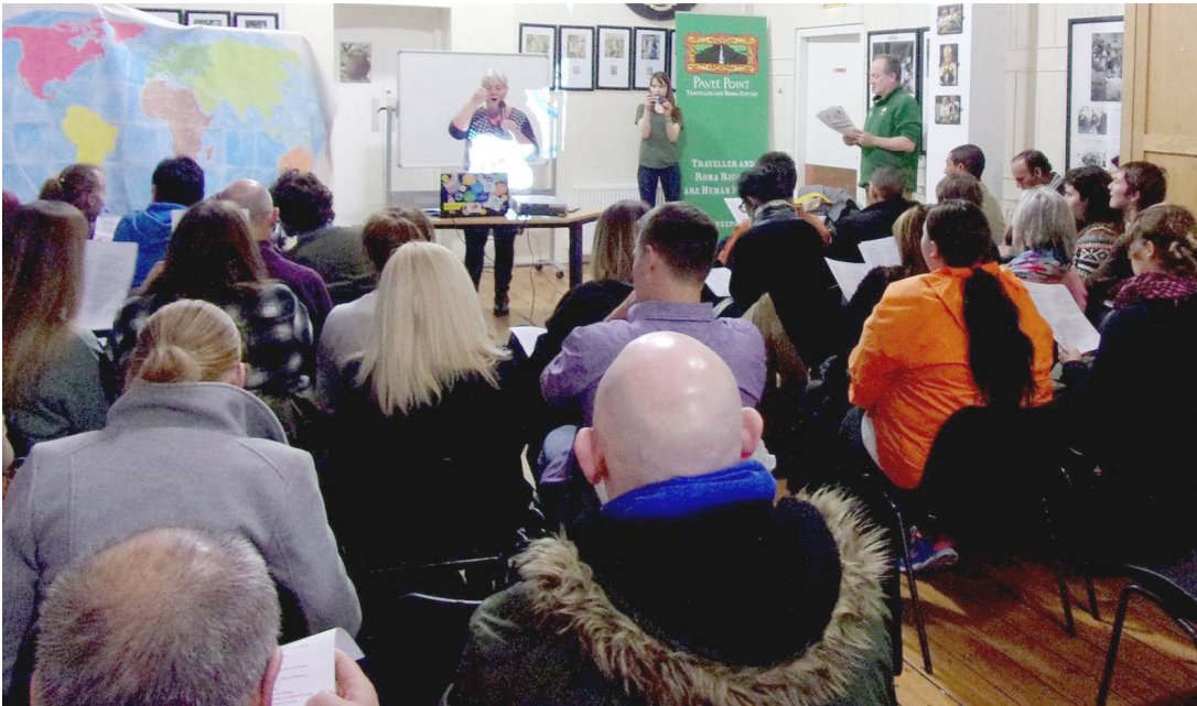
Launch of “Our Voices” with the 4 partners – Dublin, March 2016